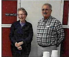
"SOUPer Bowl" Staff