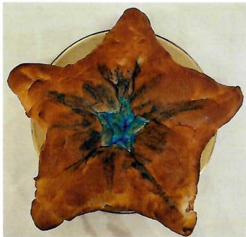
Communion Bread for January

NOTE: Since February 18 th is Ash Wednesday, there will be no NET dinner at the Reformed Church.