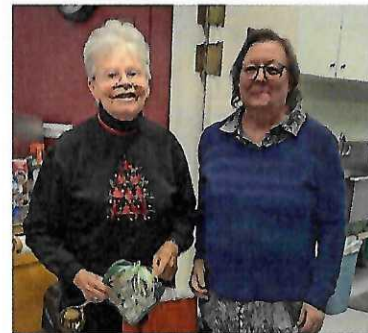
Golden Ladle Winner Our Lady of the Valley Catholic Church