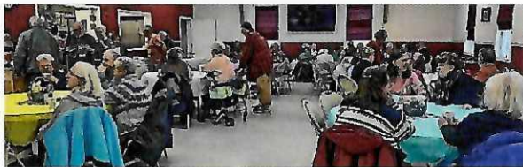
Anticipating a delicious meal...

Our next NET dinner will be held at 5:00 p.m. on Wednesday, April 23 rd , when we will be serving spaghetti and meatballs, bread, tossed salad and dessert. Please join us for an evening of fellowship with our neighbors.