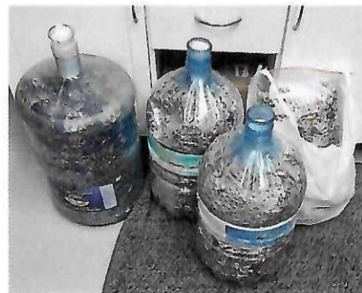
Tabs being sent to Ronald McDonald House.

Unfortunately, the financial numbers for February are not available at this time.