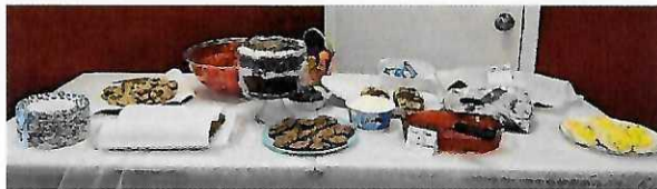
Yummy desserts Guaranteed to satisfy any "sweet tooth"