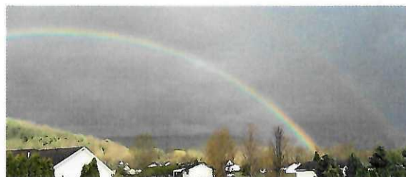
Only GOD can create such beautiful colors!