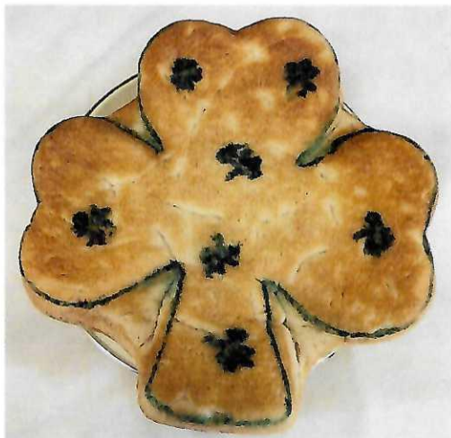
Communion Bread for March