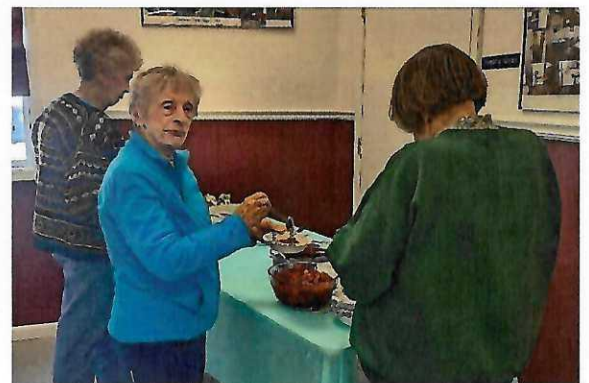
Checking out the dessert table