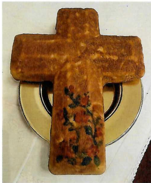
Communion Bread for April

Wed., May 28 th – 5:00 p.m. – NET Dinner at St. Mark's Church