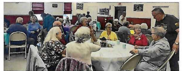
Some of our Neighbors Eating Together