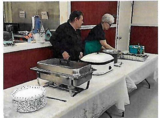
Preparing to serve