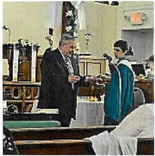
A Time for the Child In All of Us