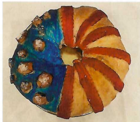
Communion Bread for June

Sun., July 27 th – 1:00 p.m. – Community Worship Service - MCS lawn (bring a lawn chair)