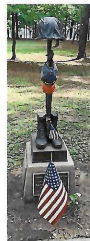
Monument at Warbird Memorial Park