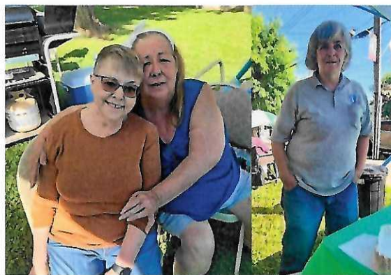
Some of our happy servers 😊

Our next 4 th Friday event will be on July 26 th from 5:30 to 8:30 p.m. Volunteers are always welcome.