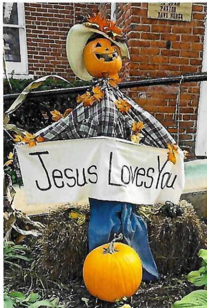
St. Mark's Scarecrow's Message for attendees of the Middleburgh Fall Festival

Sat., Oct. 26 th – 10:00 a.m. - OCC Workday