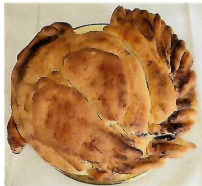
Communion Bread for November