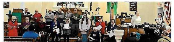
"U.S. Armed Forces Medley" was sung by our choir

To our Veterans -- Thank you for your service!