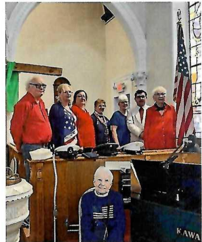
Wearing Red, White and Blue